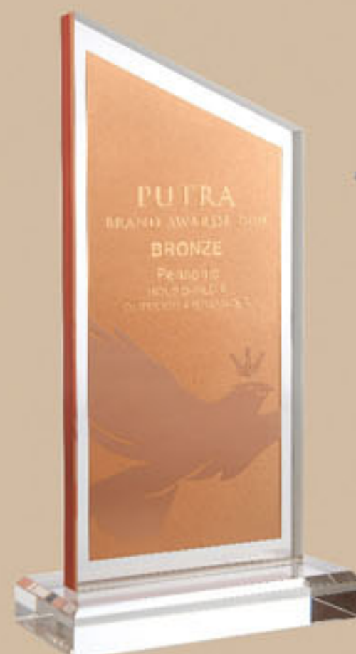
Putra Brand Awards 2010