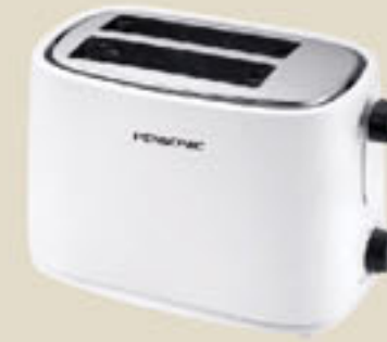
Toaster • PT-928