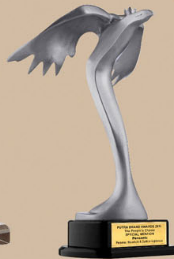
Putra Brand Awards 2011