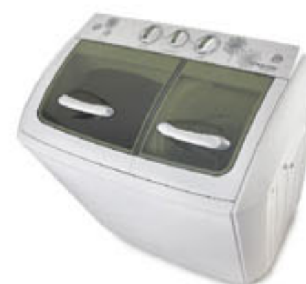
Washing Machine • PWS-9001A