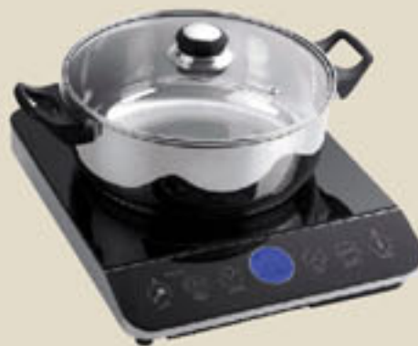
Induction Cooker • PIC-20