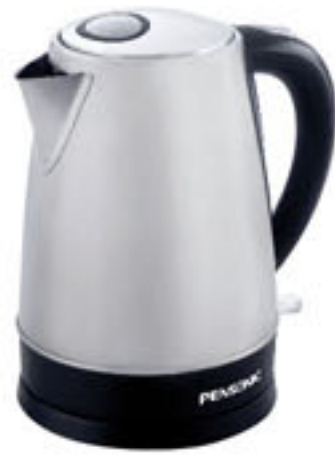
Jug Kettle • PAB-170CS