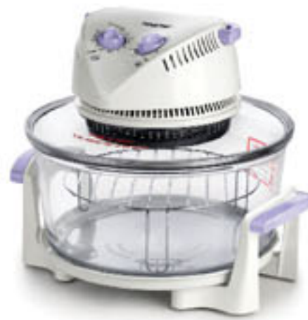
Convention Oven • PRO-910