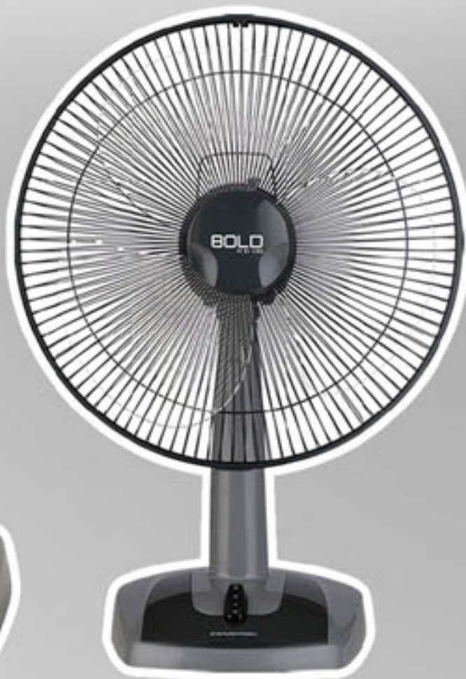
PF-45A 16" Table Fan