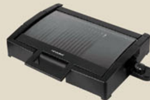
Table Grill • PTC-10