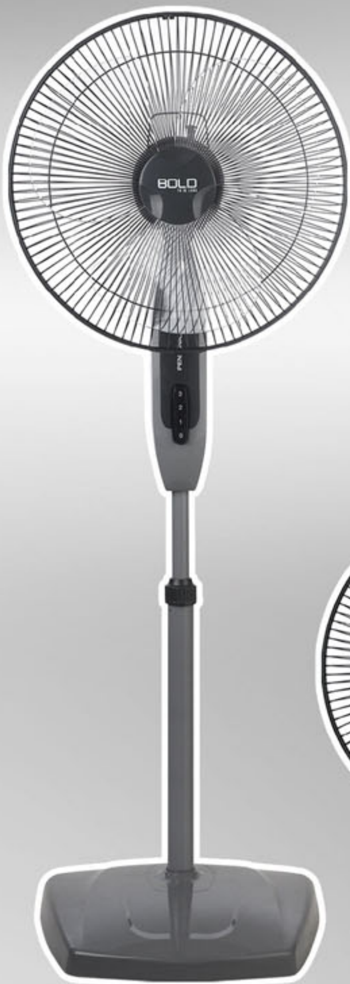
PSF-46A 16" Stand Fan