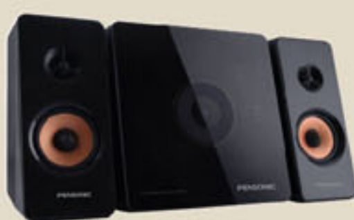
Multimedia Speaker • PSK-02