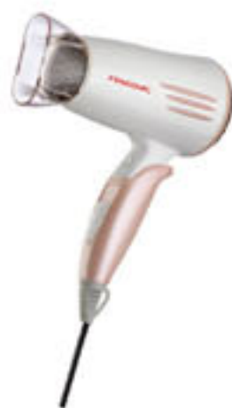
Hair Dryer • PHD-1000F