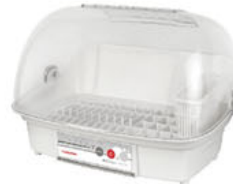
Dish Dryer • PDD-10