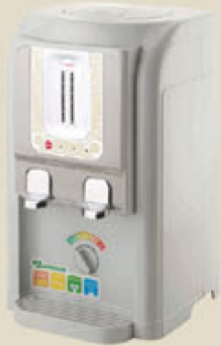
Water Dispenser • PWD-700