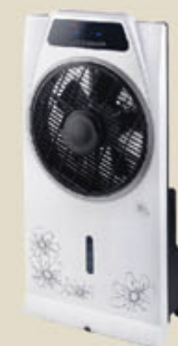
Air Cooler • PAC-320H