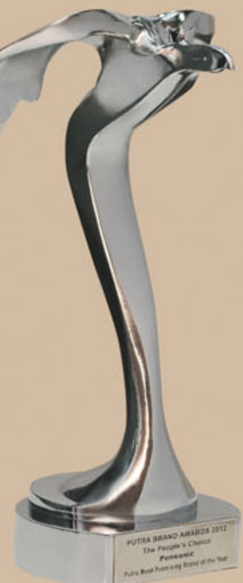
Putra Brand Awards 2012