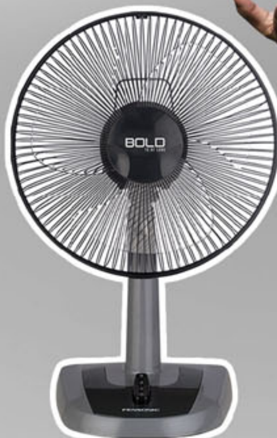
PF-35A 12" Table Fan