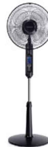
Multi-Oscillating Fan • PSF-360